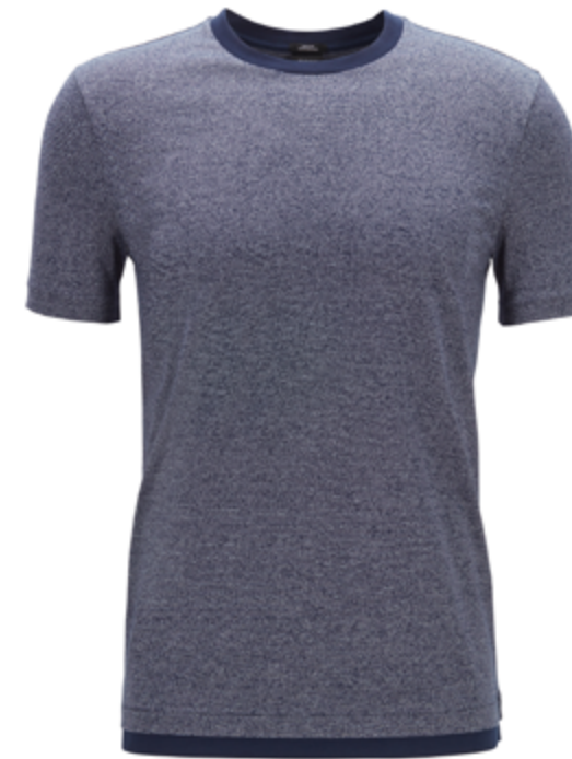
Slim-fit T-shirt in mercerised mouliné cotton