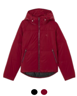
SOFT TOUCH PUFFER JACKET